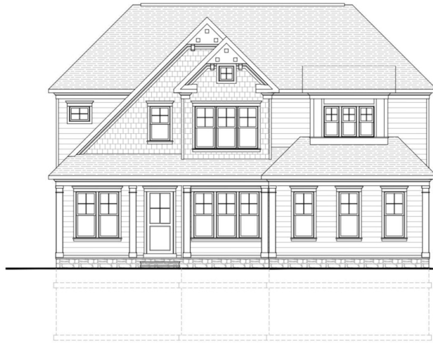
FRONT ELEVATION 8911 EWING DR. BETHESDA, MD 20817

FLOOR PLANS AND ELEVATIONS ARE FOR ILLUSTRATIVE PURPOSES ONLY. ALL DIMENSIONS ARE APPROXIMATE. SOME AVAILABLE OPTIONS ARE NOT SHOWN. PURCHASER IS HEREBY ADVISED THAT MANUFACTURER SPECIFICATIONS MAY VARY IN DIMENSIONS, COLORS, ETC. FROM THOSE DEPICTED IN PLANS, RENDERINGS, INCLUDED FEATURES, ETC.