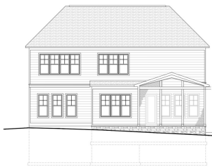
REAR ELEVATION 8911 EWING DR. BETHESDA, MD 20817

FIRST FLOOR: 1710 SQ.FT. SECOND FLOOR: 2000 SQ.FT. ABOVE GRADE FINISHED: 3710 SQ.FT. BASEMENT FLOOR: 1460 SQ.FT. TOTAL FINISHED SPACE: 5266 SQ.FT.