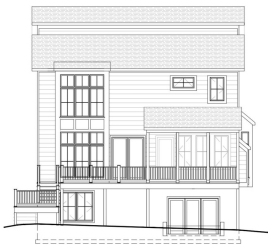
(B) REAR ELEVATION 7010 EXFAIR RD.

FIRST FLOOR: 1303 SQ.FT. SECOND FLOOR: 1592 SQ.FT. BASEMENT FLOOR: 1043 SQ.FT. ATTIC FLOOR: 541 SQ.FT. TOTAL FINISHED: 4485 SQ.FT. DATE: 8.30.23