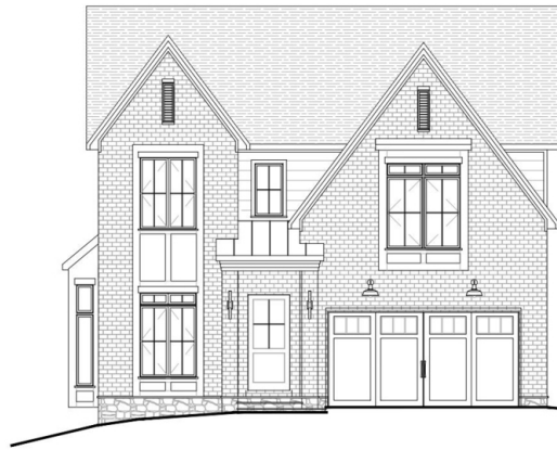
(A) FRONT ELEVATION 7010 EXFAIR RD.

FLOOR PLANS AND ELEVATIONS ARE FOR ILLUSTRATIVE PURPOSES ONLY. ALL DIMENSIONS ARE APPROXIMATE. SOME AVAILABLE OPTIONS ARE NOT SHOWN. PURCHASER IS HEREBY ADVISED THAT MANUFACTURER SPECIFICATIONS MAY VARY IN DIMENSIONS, COLORS, ETC. FROM THOSE DEPICTED IN PLANS, RENDERINGS, INCLUDED FEATURES, ETC.