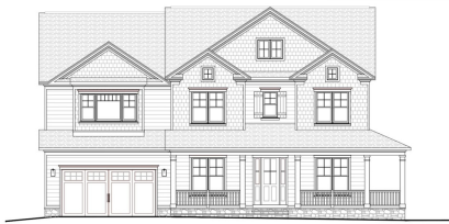
FRONT ELEVATION 5801 LENOX RD BETHESDA, MD 20817 FROM: FRONT PORCH SCALE: 1/8" = 1'-0" DATE: 08/2024 BY: JMK/MLB